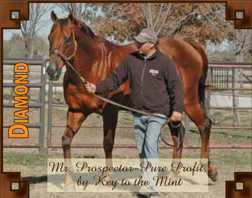
Mr. Prospector- Pure Profit, by Key to the Mint