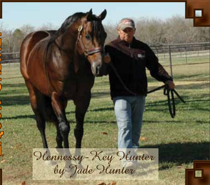
Hennessy- Key Hunter by Jade Hunter